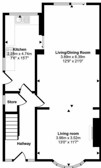
Ground Floor Approx 56 sq m / 600 sq ft

Whilst every attempt has been made to ensure the accuracy of the floor plan contained here, measurements of doors, windows, rooms and any other items are approximate and no responsibility is taken for any error, omission, or mis-statement. The measurements should not be relied upon for valuation, transaction and/or funding purposes. This plan is for illustrative purposes only and should be used as such by any prospective purchaser or tenant.